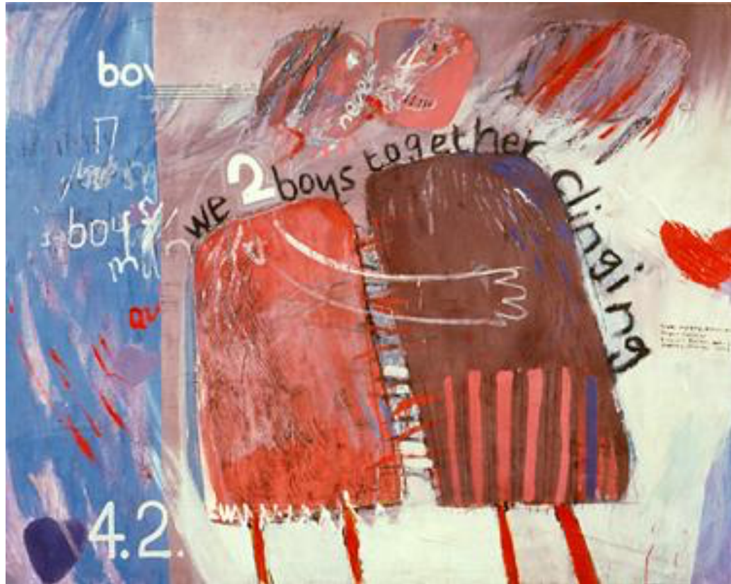
We two Boys Clinging Together (1961)